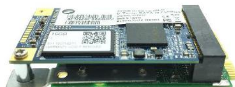
With mSATA SSD installed