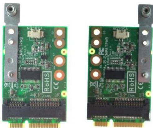
Full-size bracket, for left or right mount

WARNING: Plugging into non-compatible motherboard may cause damage