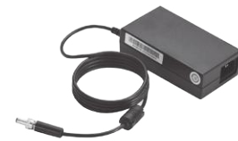
▲ AC power adapter (GOT5152T-834-J)