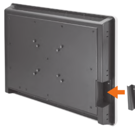
▲ CFast™ slot with protective cover